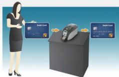
Bank Teller personalizes card with cardholder name and card number