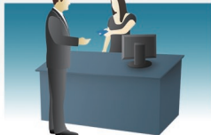
Bank Teller issues pre-personalized client card